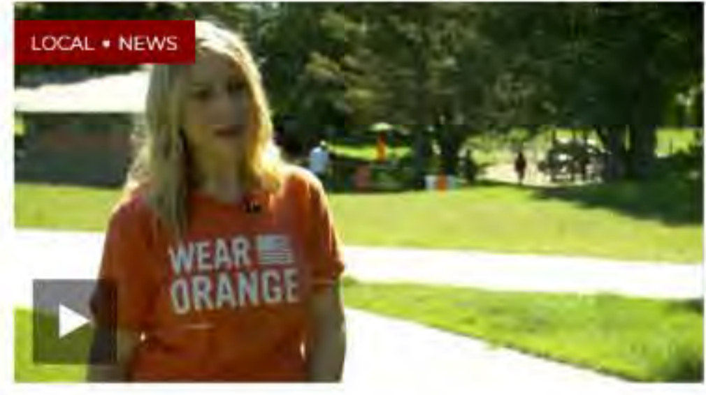
Utahns participate in 'Wear Orange' campaign, call for action to address gun violence