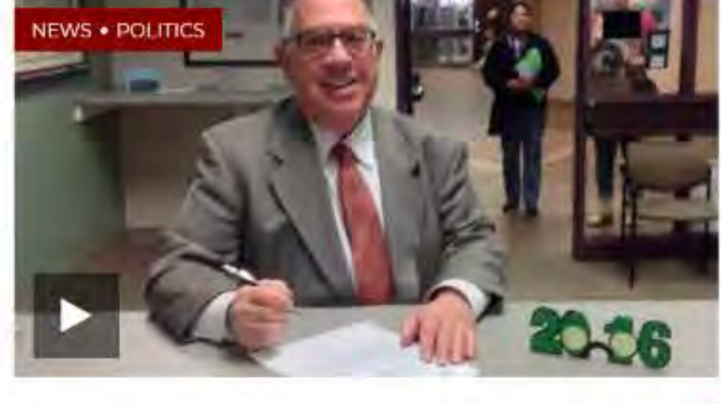
Salt Lake County Councilman, restaurateur Sam Granato has died