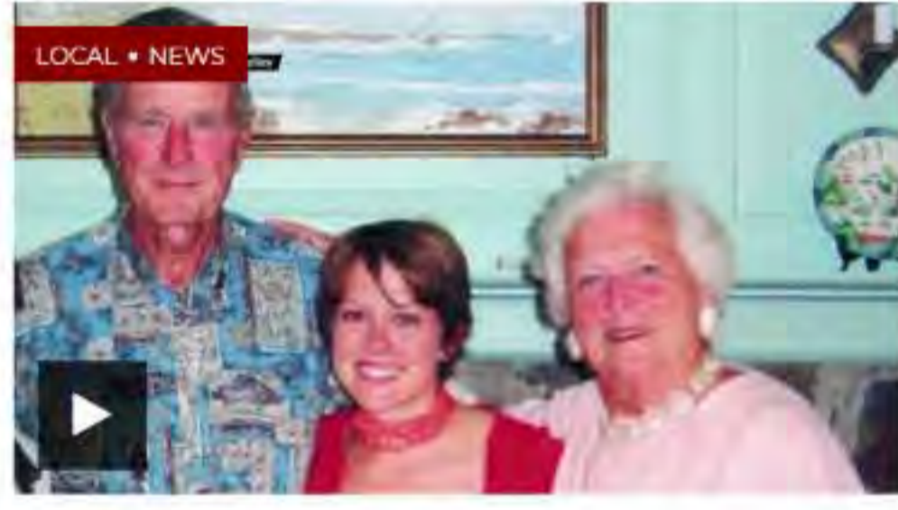
Utah native who interned for Bush family remembers Barbara as 'the enforcer', a 'compassionate public servant'