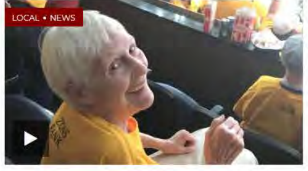
Utah Jazz make dream come true for lifelong fan now on hospice care