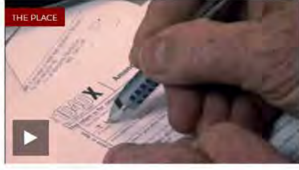
How to fight homelessness with your tax filing