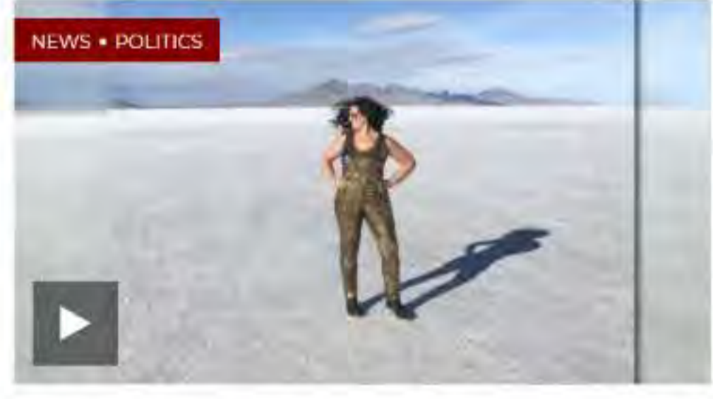
Utah congressional candidate to become 'DJ Legs' at Pride Festival