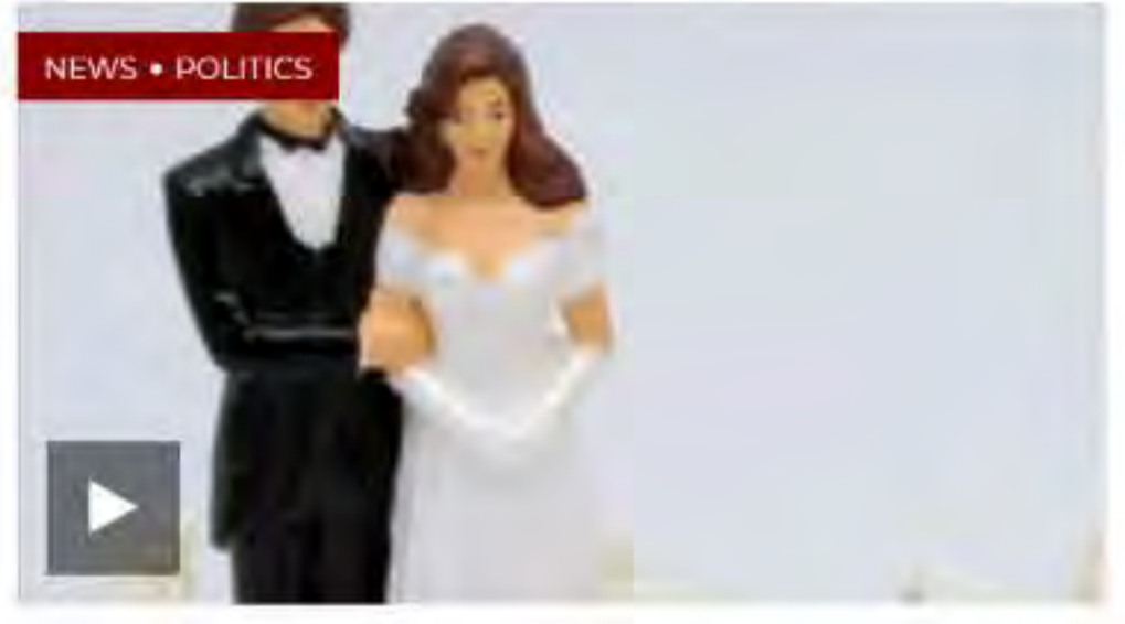
Lawmaker proposes raising Utah's marriage age to 18