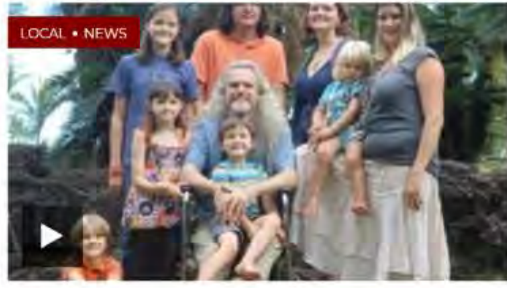
Hawaii family with local ties seeks safety in Utah