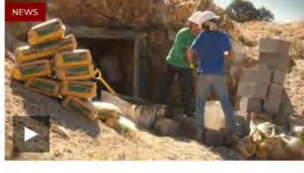
Utah's abandoned mines: Six-thousand closed, many more to go