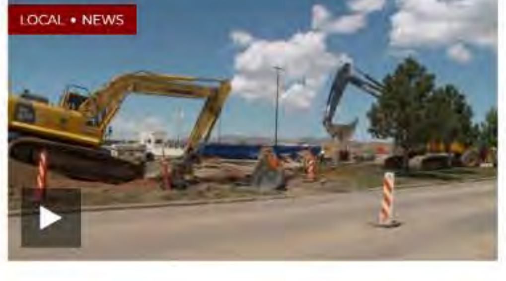
Environmental and conservation groups call out planners of inland port in SLC, citing serious potential consequences