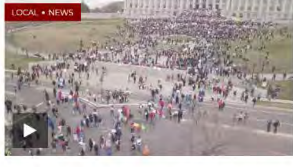
Thousands of Utahns 'March for Our Lives' in support of gun reforms