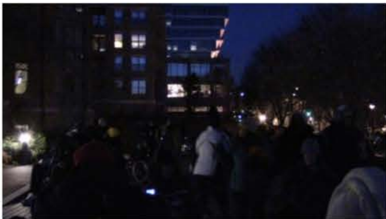
ADAPT moves up from their campground in the park to the circular driveway in front of the FDA director's ritzy building