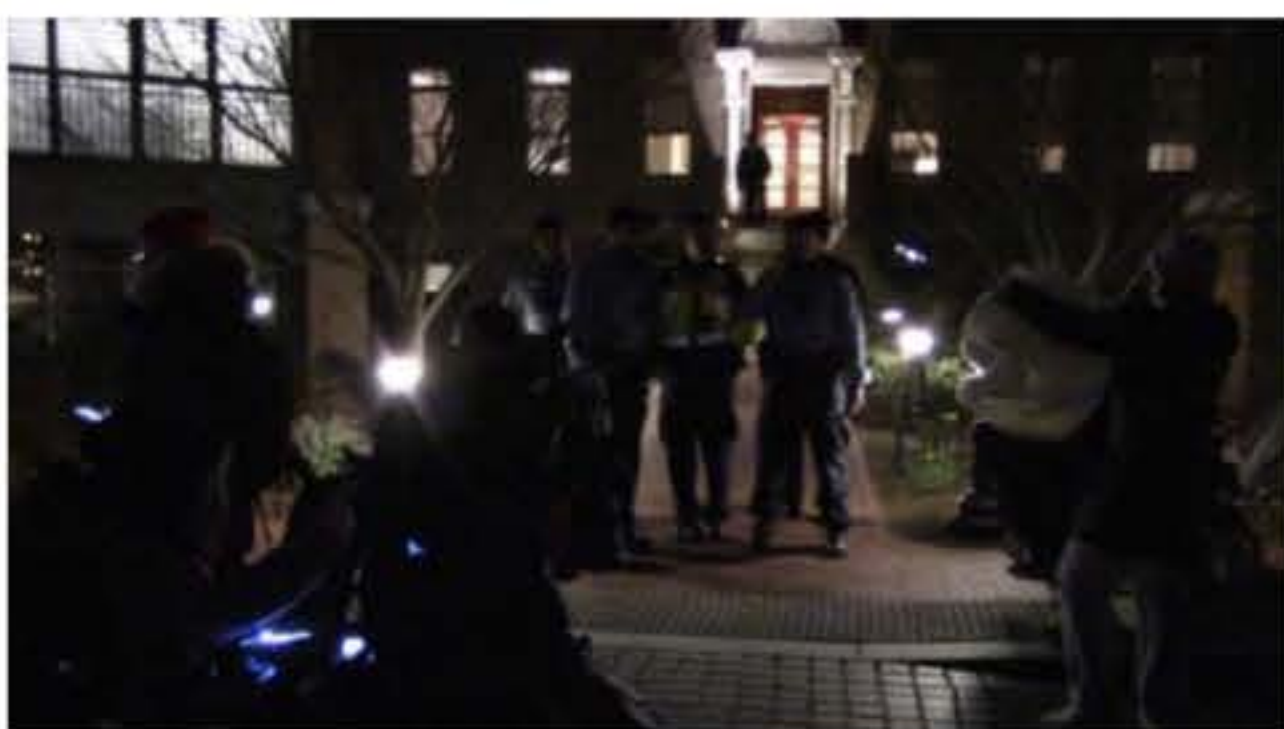
Police response was reminiscent of HLS home demos, just as the issue is