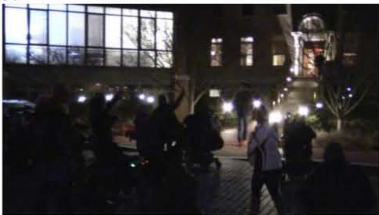
Naming and Shaming!