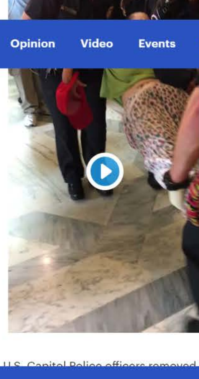
U.S. Capitol Police officers removed several people protesting Thursday.

Labor Dept signals change to Obama's overtime pay extension LABOR — 59S AGO